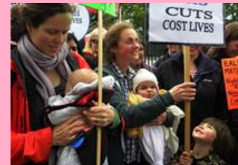
Ealing Save Our NHS protest in 2015

In 2016 the Northwick Park Maternity unit was rated as 'inadequate' with many areas needing improvement. Health bosses then promised action to improve its services to women and yet in June 2021 the Care Quality Commission once again produced a report that the service was 'inadequate'. We say – stop spending millions on re-organisation and outside management consultants. It's time to re-open Ealing Maternity.